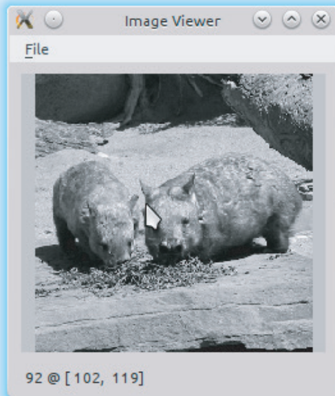
FIGURE 2.2: The wombats image with ImageViewer