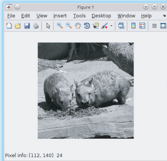
FIGURE 2.1: The wombats image with impixelinfo